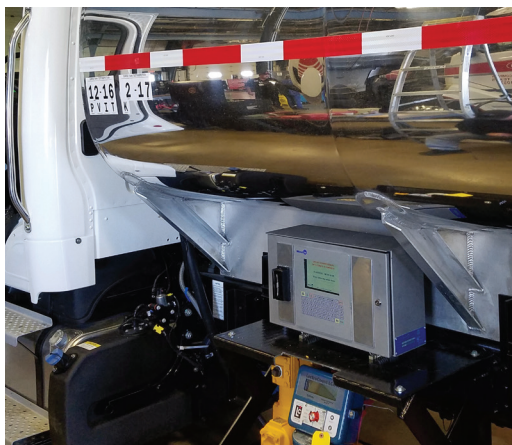
Versatile mounting location options.