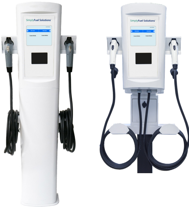
30-40 Amp Charger Pedestal and Wall Mount

Space-saving and cost-effective choice single or dual port options