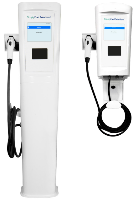
40-70 Amp Charger Pedestal and Wall Mount